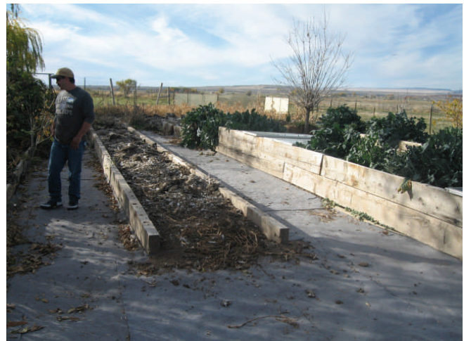
Raised beds for growing vegetables using poultry compost were viewed on the farm tour.

In order to help keep their farm economical, small-scale farmers rely on a variety of management practices to help manage production risk. These practices include Integrated Pest Management (IPM), organic farming, integrating crop and livestock systems, farm commodity diversification, and effective marketing and financial strategies. With this small-scale production and often unique management strategies, these farmers are able to contribute to local food movements, through the more than fifty farmer's markets across the state (ISDA 2010).