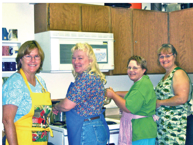
Participants from the Home Food Preservation Hands-on Canning Lab.

To provide the education necessary for home canning safely, UI Extension Educators in the Magic Valley put together a "Home Food Preservation" workshop. The workshop was based on the current Master Food