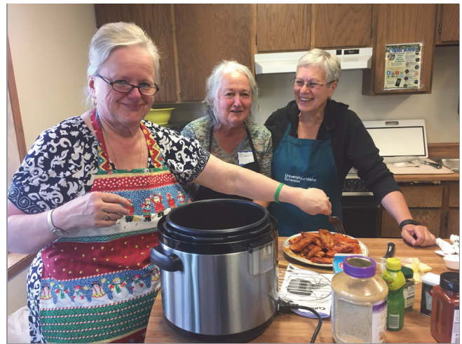
Cooking Under Pressure program participants completing a recipe during a workshop.

To encourage opportunities for Idahoans to learn how to prepare quicker healthier meals at home and expand their cooking skills, University of Idaho Extension educators developed a hands-on cooking program