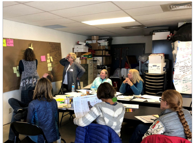
Teton Food and Farm Coalition participants begin the REM Evaluation Process, October 2018.

In October 2018, the coalition’s core leadership and representatives from the main partnership organizations (UI Extension in Teton County, High Country