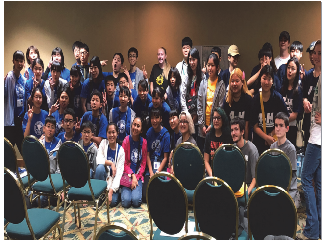
2019 International Exchange delegates arriving in Boise from Japan, Taiwan and South Korea and joined by 4-H ambassadors.

Through the exchange program, Idaho youth learn firsthand from an international student about their culture and the importance of communication at a different level. At the same time youth teach international delegates about what it's like to live in America, and more specifically Idaho. The personal connections made through the exchange provides a global perspective for students and families. The exchange student's presence in communities reaches beyond the hosting family as delegates interact within the community increasing the community's relation to the world.