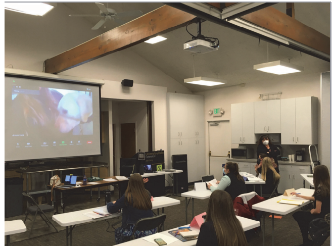
An online 4-H Know Your Government youth meeting with Ada County Prosecutor's office in January 2021.

Many 4-H programs, events and activities were rapidly changed to online delivery in response to pandemic